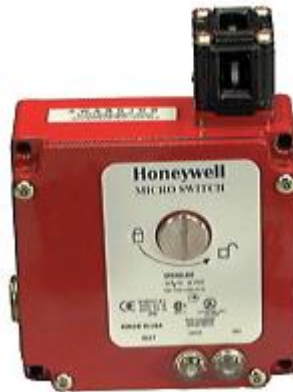
Figure 1: Final Assembly of the GKL/R-Series Dual Entry Solenoid Safety Interlock Switch

The GKL/R -Series (part numbers are identified as GKL***** or GKR*****) Dual entry solenoid safety interlock switch is a heavy-duty key switch/ solenoid lock used in large heavy duty door applications – machine momentum in industrial machinery. The product consists of 2 switch blocks. 1 switch block is operated by key and other switch block is operated by a solenoid. The switch block is fitted with up to four pairs of switching contacts (available in several configurations). It has an enclosure made of AG40A zinc die cast alloy and cover made of cold rolled steel, sealed to IP68. The switch is provided with field wiring terminals. The customer has to use a conduit plug rated for IP68 and above to ensure the integrity of sealing.