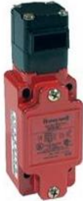
Figure 1: Final Assembly of the GK-Series Dual Entry Key Operated Safety Interlock Switch

The GK -Series (part numbers are identified as GK*****) Dual entry key operated safety interlock switch is a heavy-duty key switch used in large heavy duty door applications in industrial machinery. The switch is fitted with up to four pairs of switching contacts (available in several configurations). It has an enclosure made of AG40A zinc die cast alloy and cover made of cold rolled steel, sealed to IP67. The switch is provided with field wiring terminals. The user has to use a conduit plug rated for IP67 and above to ensure the integrity of sealing.