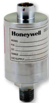
Model TJE Pressure Transducer

The test stand's data acquisition system takes the Model TJE's 0 Vdc to 5 Vdc output for recording and reporting purposes. Honeywell's Model TJE helps to measure the aircraft actuator functionality to ensure repeatable performance during aircraft utilization.