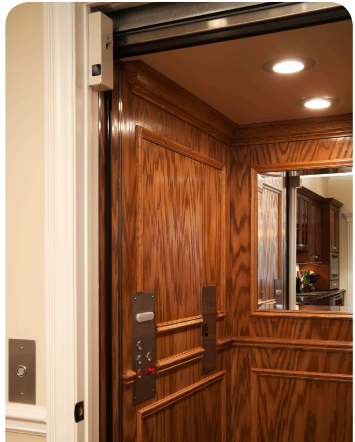
A home elevator featuring a residential door interlock switch.

Honeywell Relialign™ RDI interlocks assist in the secure and safe operation of manual elevation equipment. For example, residential elevators are found in many homes where the residents desire the ease of a powered elevator to take them to different floors. Honeywell's door interlock switches are designed with a housing that allows them to seamlessly fit into the application and the doorway. When installed, the RDI guards against accidental opening of the elevator door in a unsafe situation. If the elevator car is not present or in transit, the Relialign™ interlock will be engaged and not allow the door to be opened.