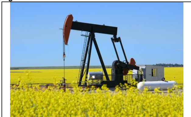
Figure 1. Production Well