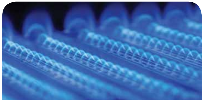
Process control gas monitoring