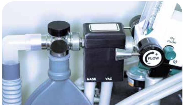
Anesthesia delivery machine