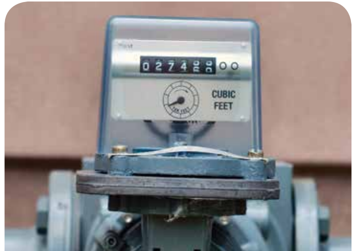
Gas leak detection

Customer Benefits: Honeywell's Zephyr™ airflow sensor may be used in a vacuum pump monitor to accurately measure the flow of the vacuum so that the desired levels are achieved. The more accurate the measurement, the more accurately the process can be controlled.