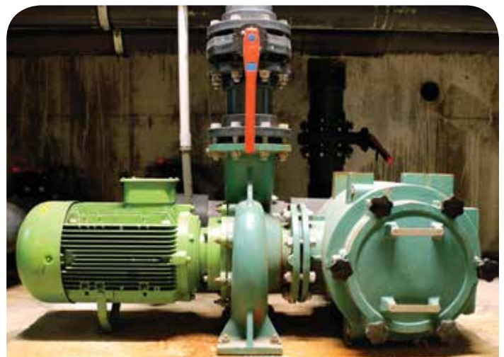
Vacuum pump monitoring