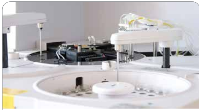
Figure 17. Analytic instrument sampling systems