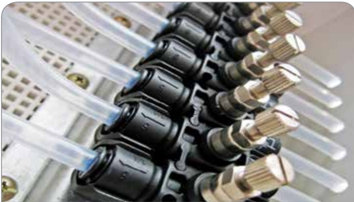
Figure 12. Automated pneumatic assembly equipment