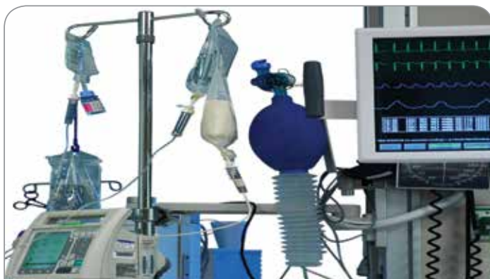
Figure 3. Patient monitoring equipment