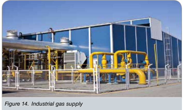
Figure 14. Industrial gas supply