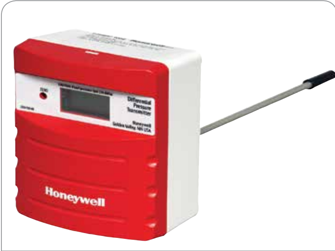
Figure 11. HVAC transmitters