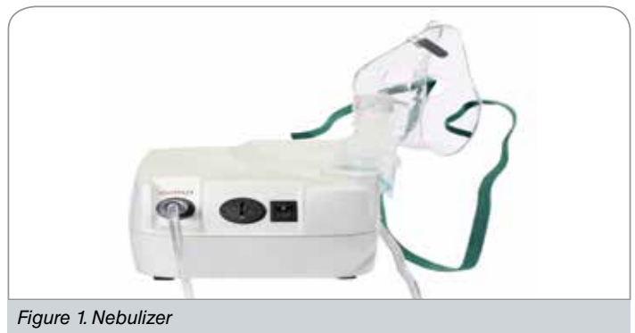
Figure 1. Nebulizer