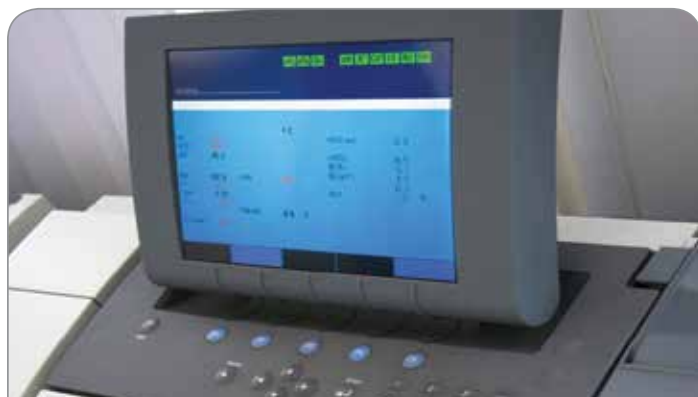
Figure 7. Blood analysis