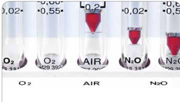
Figure 5. Hospital gas supply