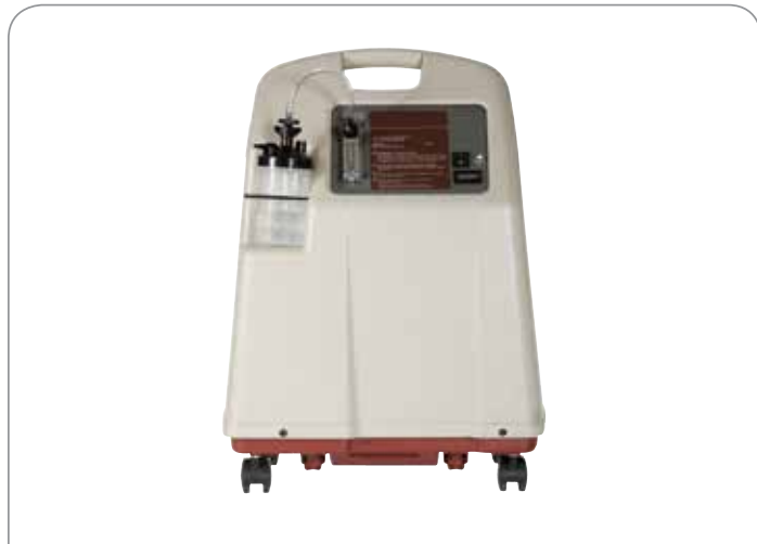
Figure 6. Oxygen concentrator