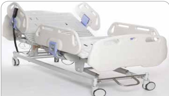
Figure 4. Therapeutic hospital bed