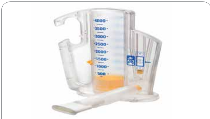
Figure 2. Spirometer