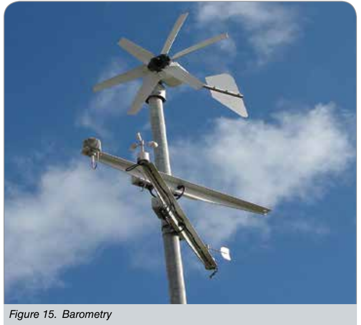
Figure 15. Barometry