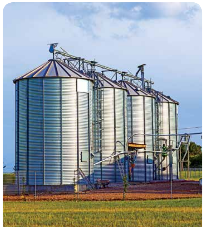
Grain Drying System