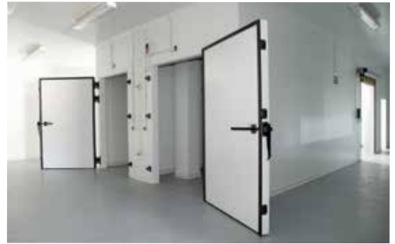
Figure 1. Industrial Refrigeration Unit