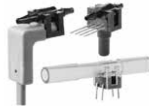
26PC Flow-Through Series