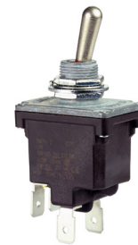
2NT91-2 2 Pole, 2 Position