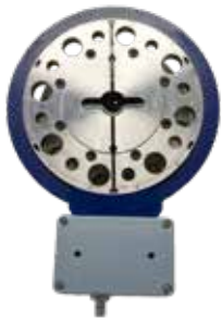
TMS 9250: Digital Telemetry

Rotary torque applications currently utilize traditional flange drive and keyed shaft drive torque sensors. As testing requirements demand higher frequency response, simplified installation and reduced down time associated with bearing wear, users demand a more accurate, versatile non-contact rotary torque sensor. With the technology incorporated in the Honeywell TMS 9250 Torque Measurement System, the industry has evolved from slip rings and bearings to the digital age. As the latest technology for torque measurement, digital telemetry can provide these advantages for end users and manufacturers of dynamometers and test stands in transportation, aerospace/defense, heavy equipment, wind energy, and industrial or factory automation applications.