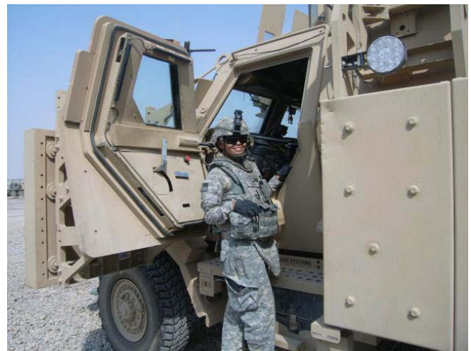
Figure 16. Military Vehicle Door Position

May be used to provide chassis position height which helps to ensure a level platform for the mounted equipment (i.e., gun/anti-aircraft missile system, mobile hospital), helping to ensure proper operation. This sensor's non-contact technology provides long product life in these rugged operating environments.