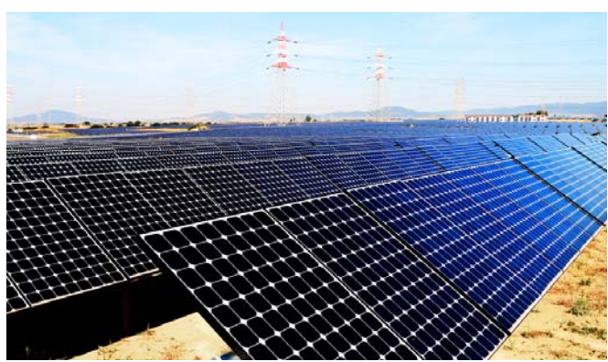
Figure 17. Ground-Based Solar Panels

May be used to provide elevation and azimuth, enhancing control and operation.