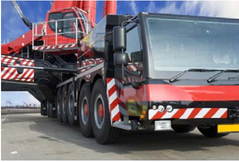
Figure 7. Mobile Cranes

May be used to provide wheel angle on the mechanically-linked axes to help ensure equal tire wear, extending expensive tire life and saving replacement costs. Information may also be used to provide optimized, restriction-free wheel turning, especially in muddy construction sites, helping to prevent stuck equipment. The non-contact technology on this equipment provided by this sensor is preferred by equipment renters.