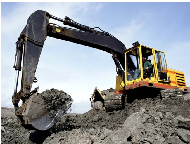
Figure 4. Diggers/Excavators

May be used to provide digging arm position in order to provide real-time survey information along with the GPS (Global Positioning System) mounted on the digging equipment. A SMART Position Sensor Arc Configuration sensor is mounted on the digging arm. This position information is sent to an electronic control unit which uses this input, along with the location input from the GPS, to provide data on the equipment position and location, as well as hole width and depth, eliminating surveyor costs. The control unit can also calculate and convey cab/digger alignment to the operator in the cab, eliminating the need for the operator to twist his/her head to see the digger, especially in uneven environments, enhancing operator safety.