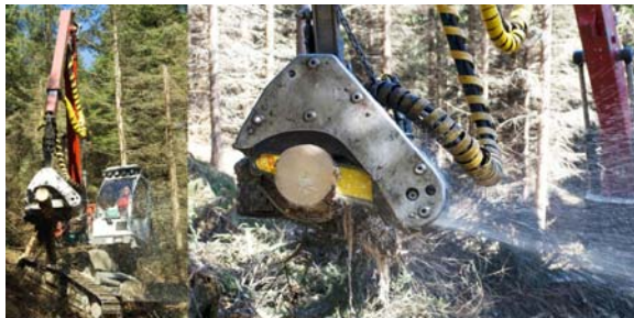
Figure 8. Timber Harvester/Processor Equipment

May be used to provide continuous cutter arm angle to the on-board computer as the equipment processes the decreasing tree length, allowing the tree diameter and lumber volume to be immediately determined. Information also helps to ensure the floating cab is aligned with the cutter head, eliminating the need for the operator to twist his/her head, improving efficiency, enhancing operator safety and reducing operator stress.