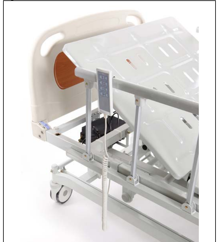
Figure 20. Patient Bed Elevation

May be used to monitor backrest elevation which helps to ensure proper angle, as well as automatic notification in the event the elevation exceeds or falls below a set value, helping to ensure optimal backrest position as prescribed by individual patient's medical condition.