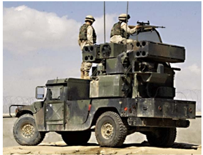
Figure 15. Chassis Suspension Systems

May be used to provide weapon elevation for a variety of targeting functions (i.e., 180° gun turret positioning, no-fire above a specified elevation) that may be controlled through a remote joy stick, helping to ensure firing accuracy.