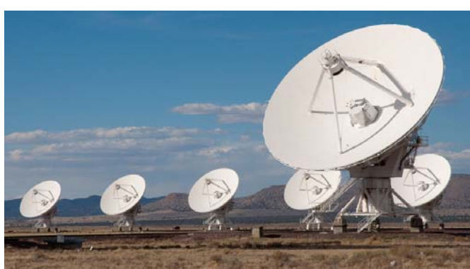
Figure 18. Ground-Based Satellite Dishes

May be used to provide elevation and azimuth, enhancing control and operation.