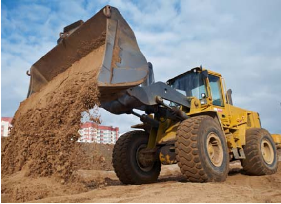
Figure 3. Front End Loaders

May be used to automate repetitive motion sequences, such as dig-dump-dig, which then require only a single hit of a joystick to repeat, improving efficiency and reducing operator stress. May also be used to provide bucket height position restriction which helps to avoid overhead power lines or other obstacles in the area (envelope control), enhancing operator safety.