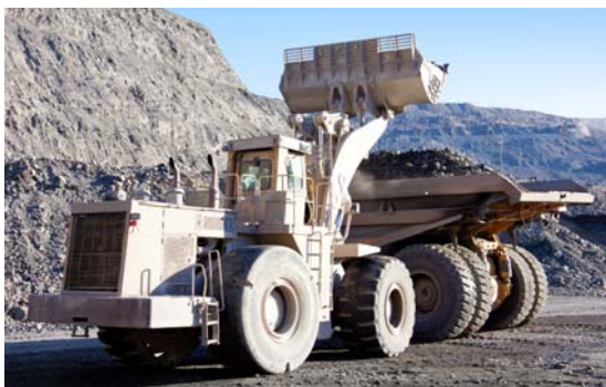
Figure 9. On-board Loader Weighing Systems

May be used to provide loader bucket angle in order to help determine on-the-spot content weight which eliminates wasteful and time-consuming dumping onto a separate weighing site before loading into the truck bed, helping to prevent overloads, and saving fuel and labor costs.