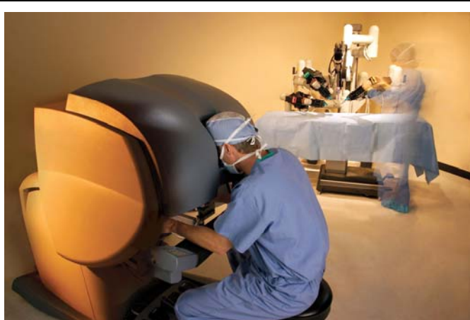
Figure 19. Robotically-Assisted Surgery Equipment

May be used to provide position of the robotic arms that hold the articulated instrument tips, allowing the precise control that enables revolutionary minimally invasive surgical procedures.