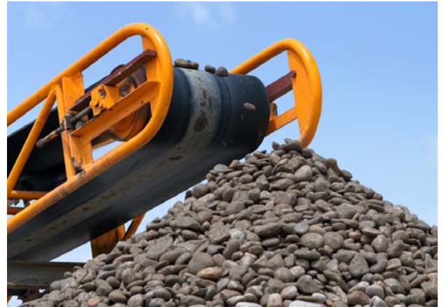
Figure 10. Telescoping Conveyor Systems

May be used to provide conveyor elevation which helps to ensure the conveyor is at the optimal height to provide the correct mix of falling material containing uneven particles (i.e., dirt, gravel, ore) as it is processed off the conveyor into piles. This sensor's durable and reliable non-contacting technology increases product life in these harsh environments.