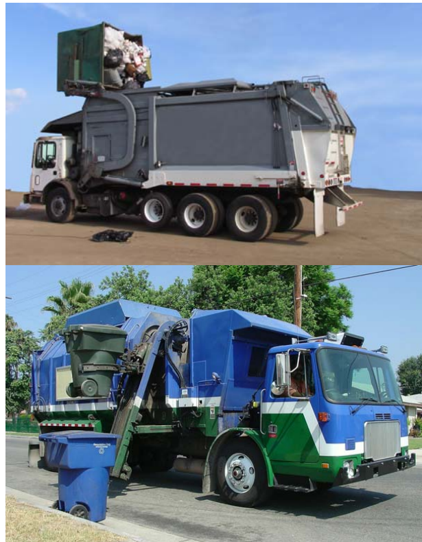
Figure 6. Refuse Trucks

May be used to monitor the angle of a truck's twin dumpster lifting arms. May also be used to provide position to the operator inside the cab who uses a joystick to manipulate automated reach arms to accurately pick up and empty smaller trash cans. One sensor can replace at least three proximity sensors, providing absolute position versus approximate position. The sensor's non-contact technology increases product reliability and life in these dirty, tough environments.