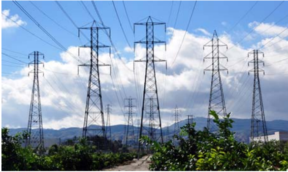
Figure 12. Power Generation

May be used to provide switching contact angle, ensuring contact has moved to the correct position through its 0° to 90° range. Information may also be used to determine contact speed, helping to identify slower contacts that may be wearing out, preventing possible catastrophic power failures.