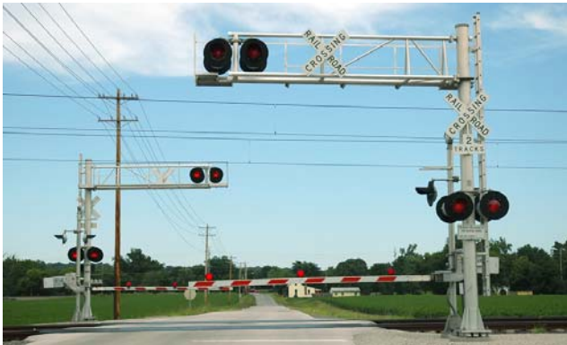
Figure 13. Rail-Road Crossing Arms

May be used to provide crossing arm position, enhancing traffic safety. This sensor's non-contact technology increases reliability and product life in this harsh environment.