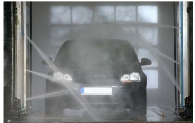
Figure 11. Automated Touchless Vehicle Wash Systems

May be used to provide position of the water spray arm that runs the length of the vehicle during the wash cycle, allowing the system to know when the arm has reached the end of the vehicle. This durable, IP67-sealed sensor replaces the proximity sensors that are currently used in this harsh environment, providing greater reliability and longer product life.