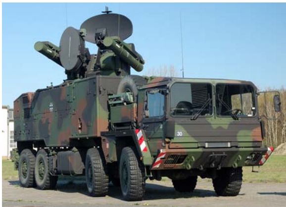
Figure 14. Remote Weapon Systems

May be used to provide weapon elevation for a variety of targeting functions (i.e., 180° gun turret positioning, no-fire above a specified elevation) that may be controlled through a remote joy stick, helping to ensure firing accuracy.