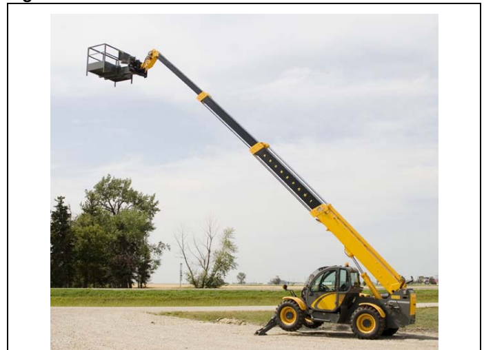
Figure 2. Aerial Work Lift Platforms

May be used to provide boom angle position which helps to prevent tipping on inclines and keeps the equipment within a safe extension range (envelope control), enhancing operator and bystander safety.